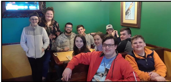
Breakaway 2019 Ocean City, MD

April 18 - 7:00 pm - Maundy Thursday Service April 19 - 7:00 pm - Good Friday Service April 21 - 7:30 am - Sunrise Service at the White Church, Union Cemetery 10:00 am - Worship